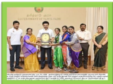
REPUBLIC DAY CULTURALS PARTICIPATION