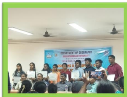
IGS Talent Test (2024-2025 & 2022-2023)