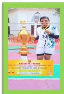
KABADDI Tournament and Sports Committee (2024-2025)