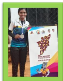
KABADDI-CM Trophy (2024-2025)