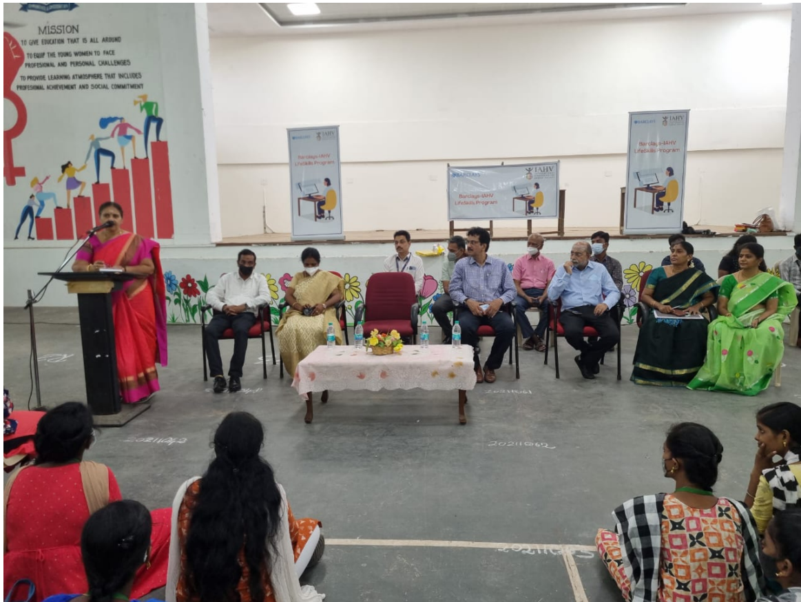
Barclays's Mega Job fair organised by the Training and Placement cell on 8 th July 2022