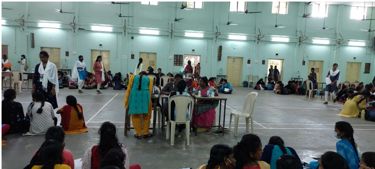
Mega Job fair organised by the Training and Placement cell on 6 th May 2022